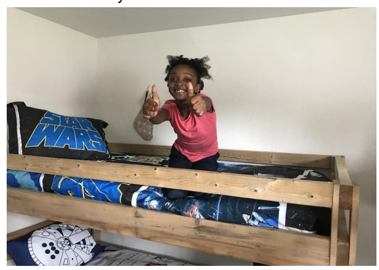
Blankets by Hearts & Hands in use