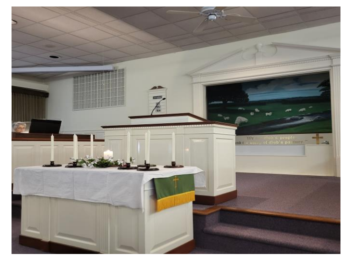
Candles Lit for Blue New Year