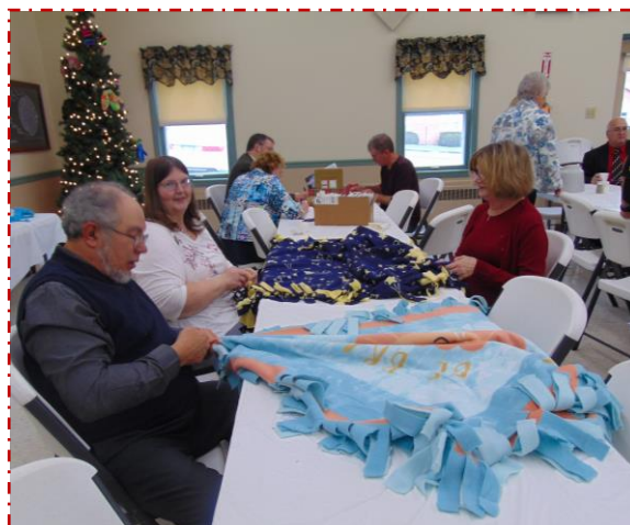
Advent Dinner Activities