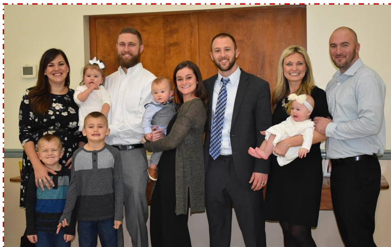
The 3 infants who were consecrated, pictured with their families