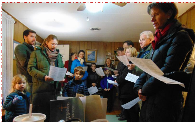
Christmas Carolers making joyful noise