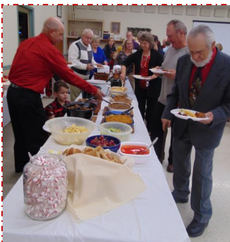
Advent Dinner Potluck Buffet

So many people made all of this possible. Folks who decorated the sanctuary so beautifully, folks who bought poinsettias, folks who prepared music, folks who directed the children for their program, folks who prepared service projects for the Advent Dinner and made the Parish Hall look as beautiful as it looks all year. So many others. Being Church together is a joy. Being bound together in Christ is a joy. Being together in our love for God and our love for neighbors is a joy! December celebrates it all!