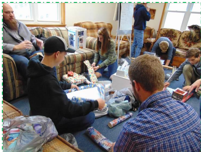
Youth wrapping gifts